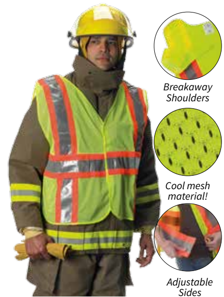
V+AM-OSC2GBV Classic 5 Point Break-away Vest