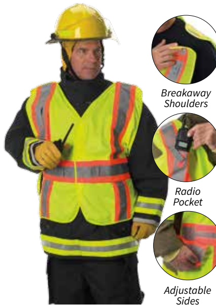
V+AF-OSP2GBV Premium Solid 5 Point Break-away