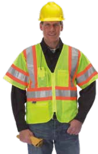
V+AM-C3GDK-L Class 3 Sleeved Vest