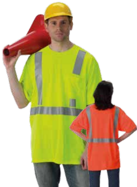
T-A2-P ANSI Class 2 Performance T-shirt