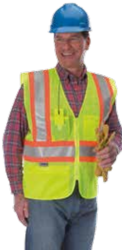
V+AM-C2GDK-L Class 2 Mesh Vest