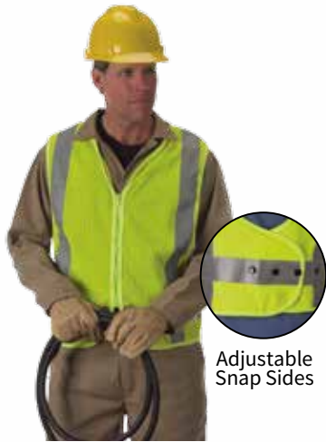
Adjustable Snap Sides