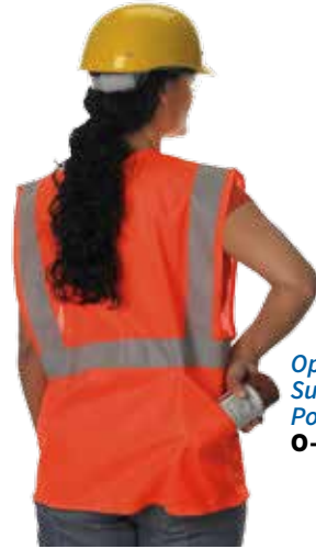
Optional Surveyor Back Pocket! O-SURV_PKT