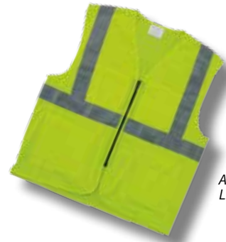
Also available in Lime Yellow!