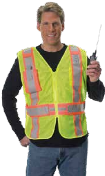
V+AM-OSP2GBV Premium Mesh 5 Point Break-away