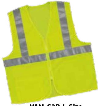
VAM-C2P-L-Size Zipper Closure