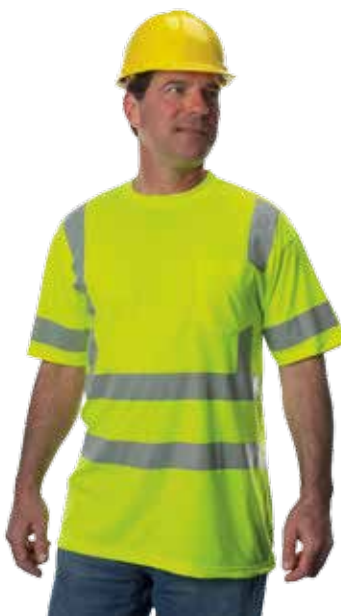
T-A3-P ANSI Class 3 Performance T-shirt