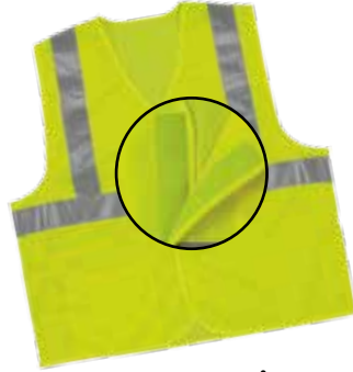
VAM-C2PV-L-Size Hook and Loop Closure