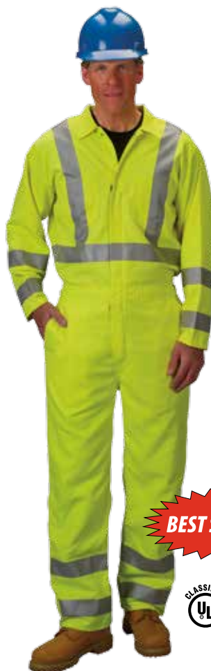
A. Style TSP010L Coverall Coverall with Zippered Boot Openings