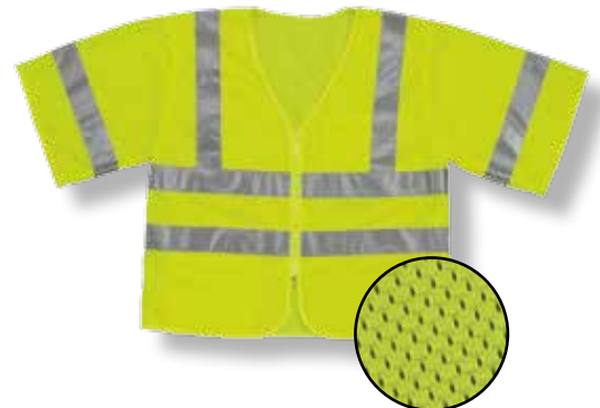
VAM-C3SP-L-Size ANSI Class 3 Polyester Mesh Sleeved Vest