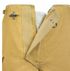
Zipper Closure on coat / Hook & Dee on pants