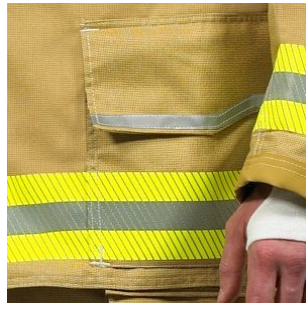
8" x 10" Semi Bellow Pockets With Vizgrip™ flap.