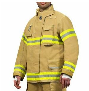
Basic Configuration 32" style coat / Regular waist pants w/ High Back

New York style Scotchlite® 3" Segmented (triple trim)