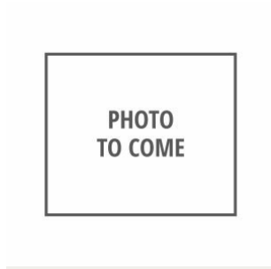
Waist Adjustment & Suspenders

Two adjustment straps with "alligator" clips