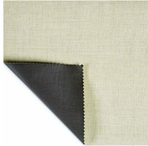
Moisture Barrier: CROSSTECH® Black moisture barrier – Type 2F, 4.7 oz/yd 2