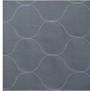
Thermal Barrier: Glide Ice™ 2-layer