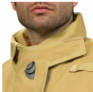
3" BR-1 Collar Patented BR-1™ collar – 3" – INNO5000™ Series – 4 layers