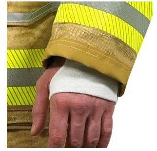
White Nomex wristlet with thumb hole