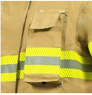
8" x 4" x 2" Radio Pocket with mic loop Left Chest.