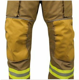
Enhanced Mobility Knees™ (EMK™) Knees reinforced with gold Polymer Coated Aramid.

Includes extra padding in the knee (14 oz Nomex® felt).